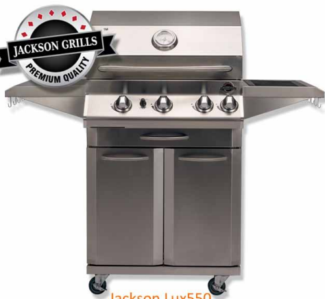
Jackson Lux550 3 Burner

Flame Genie was a product that caught Team AES by surprise, but we instantly fell in love with it! This wood pellet fire pit is a must for all campers, or an addition to a homeowners collection of fire features. Simply fill with pellets, light with gelled/square firestarter, sit back and enjoy! The magic of the Flame Genie's burn is