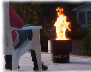
Flame Genie by HY-C Wood Pellet Fire Pit