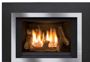
New Enviro Surround - Borderview w/Brushed Nickel