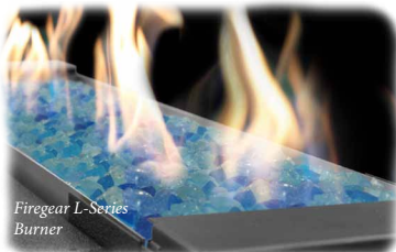
Firegear L-Series Burner