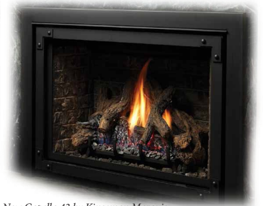
New Capella 43 by Kingsman Marquis

Don't forget all the presentations led by industry greats!