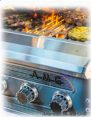
American Muscle Grill

If you happened to miss Dealer Days, don't sweat it. We'll be back next year with more new products, specials and good times to be had. Take a look at all the new products below that made a special appearance at Dealer Days: