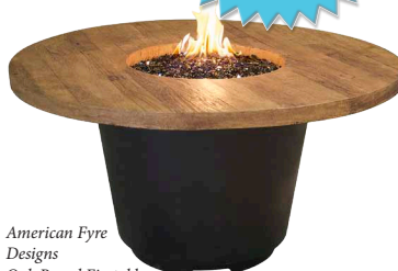
American Fyre Designs Oak Barrel Firetable