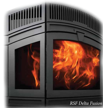
RSF Delta Fusion