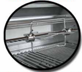
Heavy Duty Grids