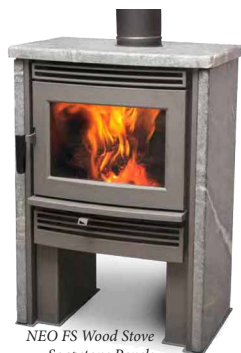
NEO FS Wood Stove Soapstone Panels